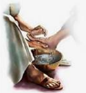
"You should wash each other's feet" (John 13:14).